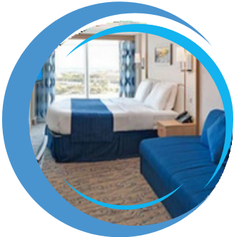
Spacious Ocean View With Balcony $1,125 per person $2,250 Total