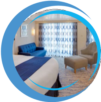
Jr. Suite $1,380 per person $2,760 Total